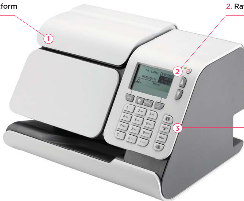
2. Rate Wizard