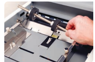
Ensure reliable feeding with easy maintenance feed wheels