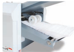
Closed outfeed stacker for tight spaces